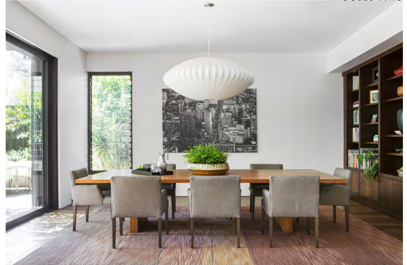
Paint colours are reproduced as accurately as printing processes allow.

◀ panelling and separate access to the backyard. Behind the wall on the opposite side of the hallway are a garage and laundry.